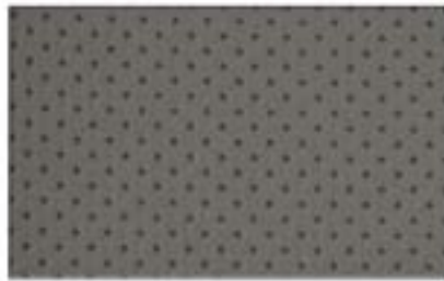
RD - 02