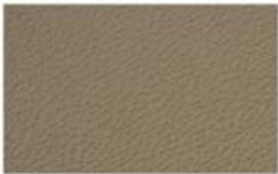
RP - 07