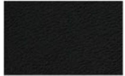
RP - 03