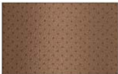
ND - 14