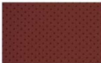
RD - 08