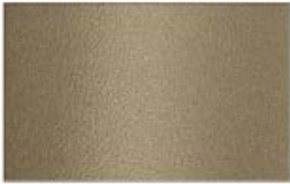
NP - 07