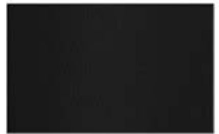
NP - 03