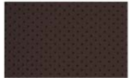
RD - 09