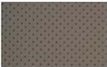
RD - 10