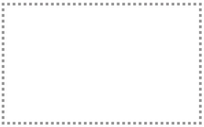
ND - 11