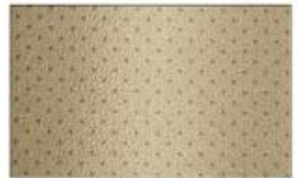
ND - 12