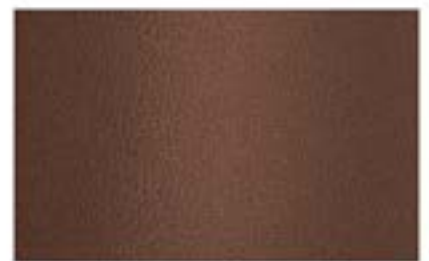
NP - 15