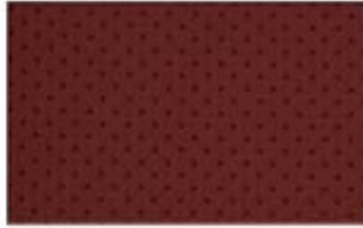
RD - 05