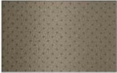
ND - 04