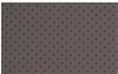
RD - 16