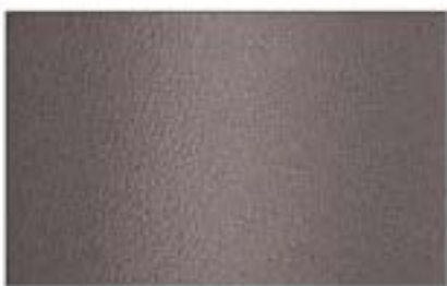
NP - 16