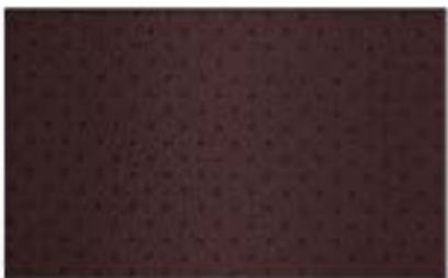
ND - 13