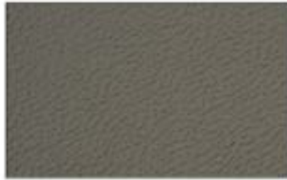
RP - 02