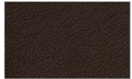
RP - 09