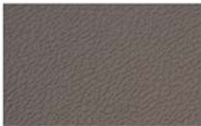
RP - 16