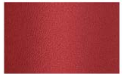
NP - 06