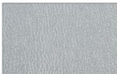
RP - 17/Silver