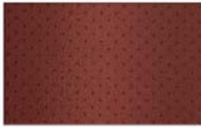
ND - 08