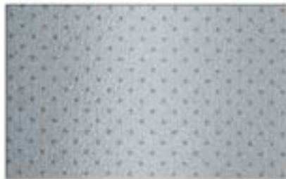
ND - 17/Silver