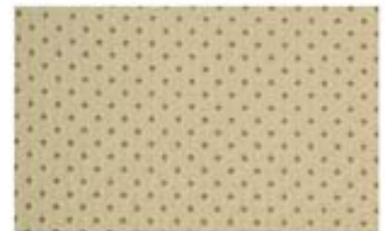
RD - 12