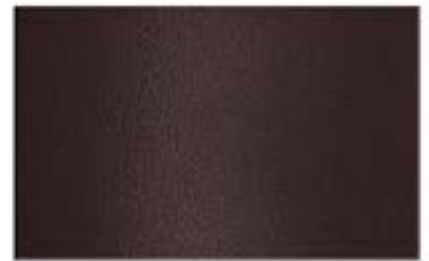
NP - 09