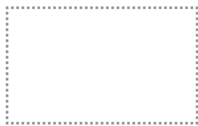
NP - 11