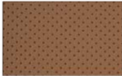
RD - 14