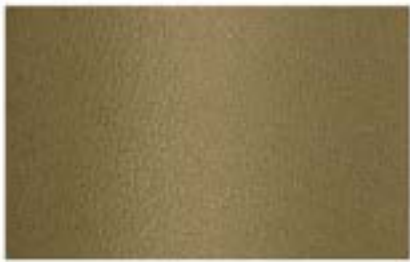
NP - 01