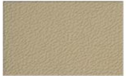
RP - 12