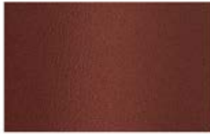
NP - 08