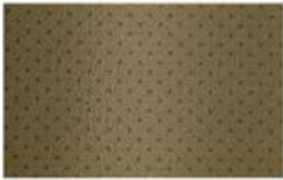
ND - 01