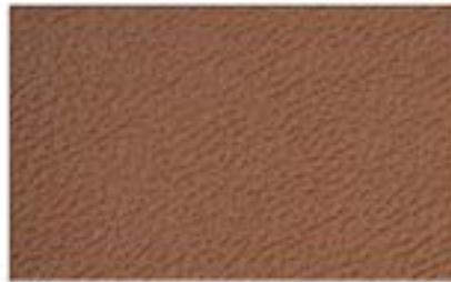
RP - 14