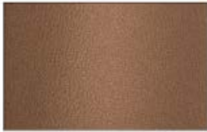
NP - 14