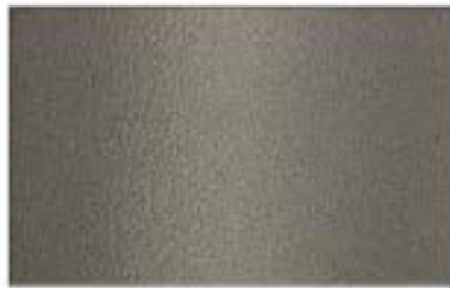
NP - 02