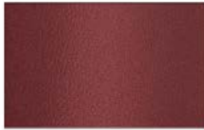
NP - 05