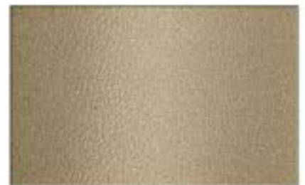
NP - 12