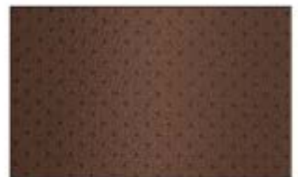
ND - 15