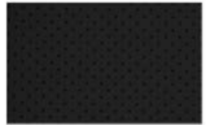
RD - 03