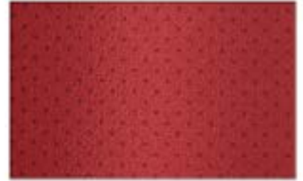
ND - 06