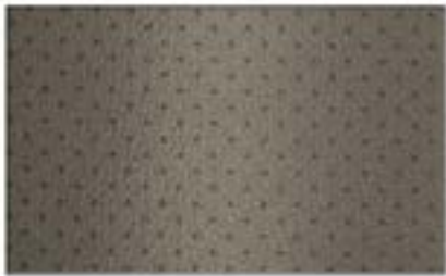
ND - 10