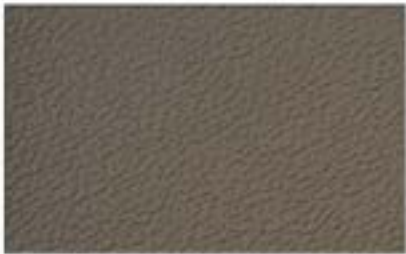
RP - 10