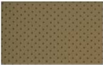
RD - 01