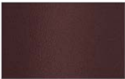
NP - 13