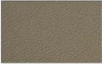
RP - 04