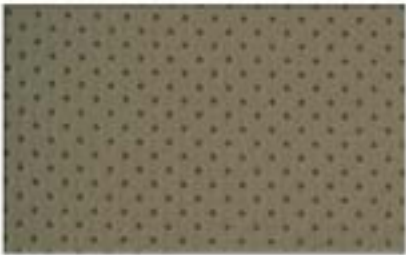
RD - 04