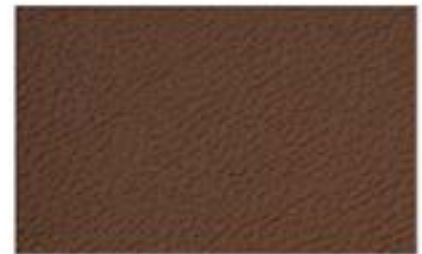
RP - 15