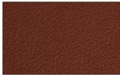
RP - 08