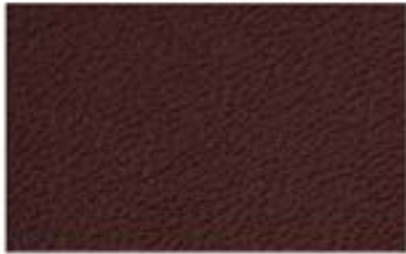
RP - 13