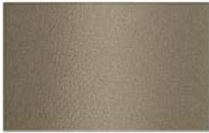
NP - 04