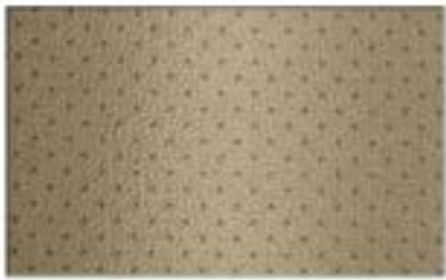
ND - 07