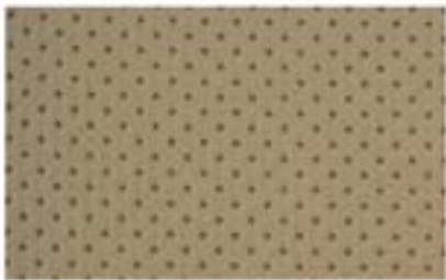
RD - 07