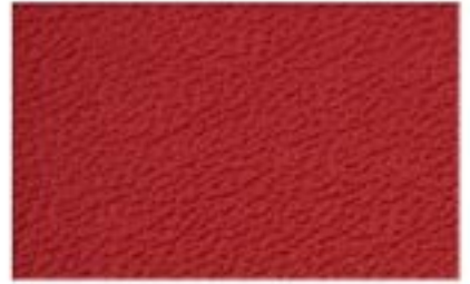
RP - 06