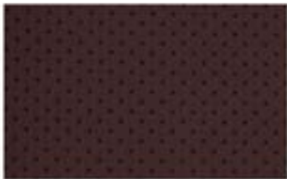
RD - 13