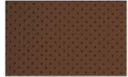
RD - 15