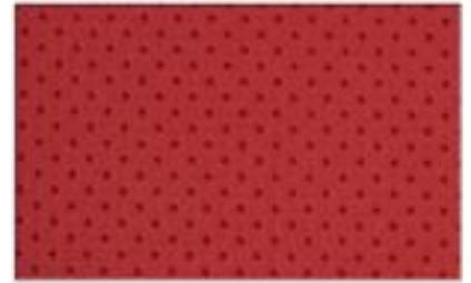
RD - 06