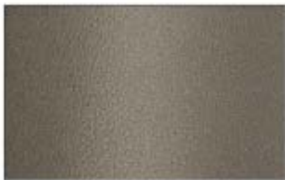
NP - 10