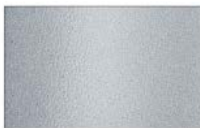
NP - 17/Silver