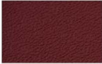
RP - 05