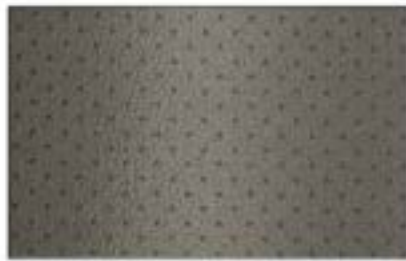
ND - 02