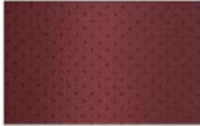
ND - 05