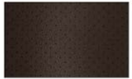
ND - 09