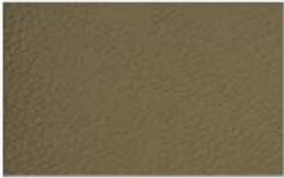
RP - 01